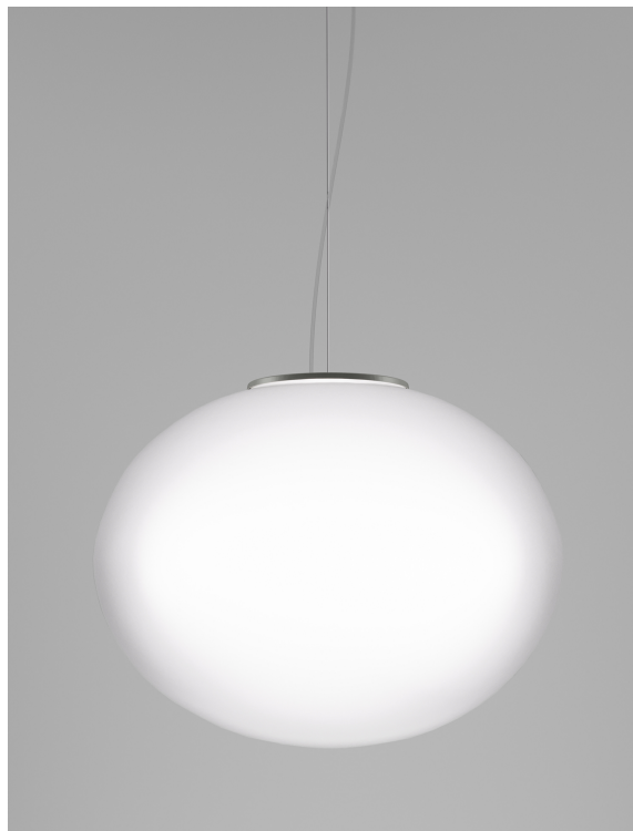
LUCCI SP G BCST NI 3E CE